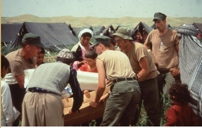
Red Rats Working with Local Kurds Erecting Refugee Tents, OPC 1991.