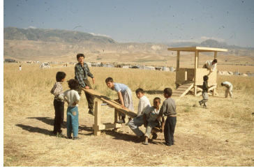
In their "off" time the Rats Built Playgrounds for Kurdish kids, OPC 1991.