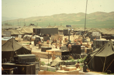
Charlie Company Assembly Area, OPC 1991.