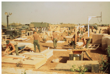
World's Largest "Sh*tter" Assembly Line, OPC 1991.