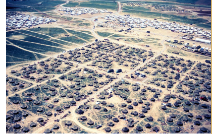
Aerial View of Kurdish Refugee Camp, OPC 1991.