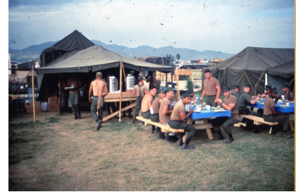
Outside our Galley in the 'Roo Zoo.