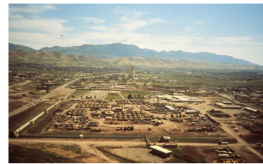
Aerial View of Camp D.W. Sommers with the Zakho 'Roo Zoo in foreground, OPC 1991.