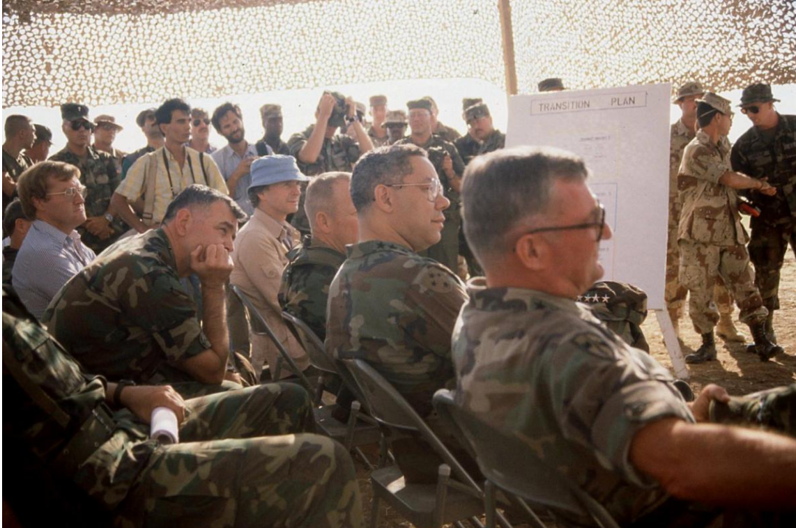
GEN Powell and GEN Shalikhshvili listening to CM2 Lanning reciting "The Kurdish Catastrophe."