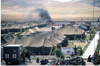
'Roo Zoo Admin Area with Burnouts in the Background, OPC 1991.