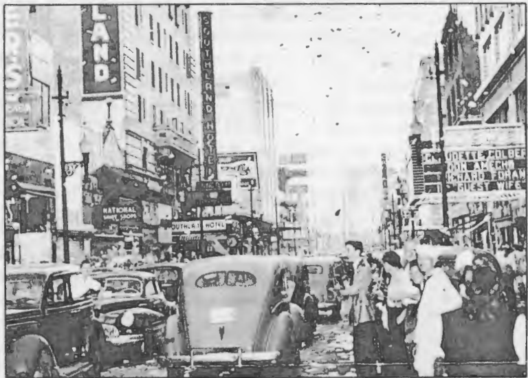
Granby Street on V-E Day, May 8, 1945.