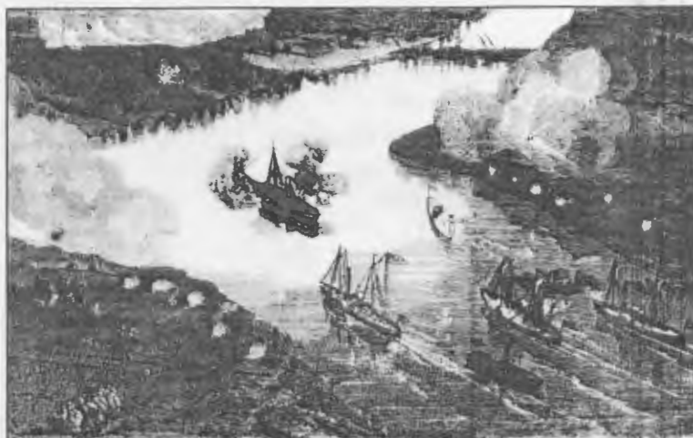
The Battle of Drewry's Bluff - The Union squadron withdrew back to Hampton Roads, with USS Galena badly damaged, because of the high elevation of Confederate guns and obstructions in the James River. (Naval Historical Center photograph of Harper's Weekly engraving)

15, 1862 Battle of Drewry's Bluff. A Union squadron, consisting of the ironclads USS Galena and Monitor and the gunboats Aroostook , Port Royal and Naugatuck , engage Confederate guns at Fort Darling, Drewry's Bluff, on the James River. After a four hour battle, the Union ships withdraw back to Hampton Roads.