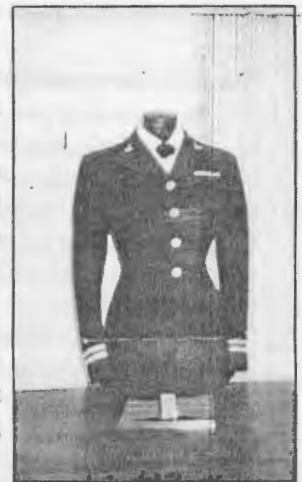
Pictured here is Grantham's WAVES uniform. It is now on display at the Norfolk International Airport.

After the war, the uniforms of women in the Navy came closer in appearance to those of men, reflecting women's greater participation in naval service.