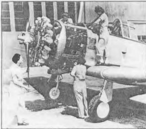
WAVES aviation metal smiths working on a SNJ trainer at NAS Jacksonville.

The great hardships of war are always accompanied by great social changes. In World War II, the armed services needed more manpower and one obvious solution was to enroll women in military service. In 1942, Congress authorized the Navy to establish the WAVES: "Women Accepted for Volunteer Emergency Service."