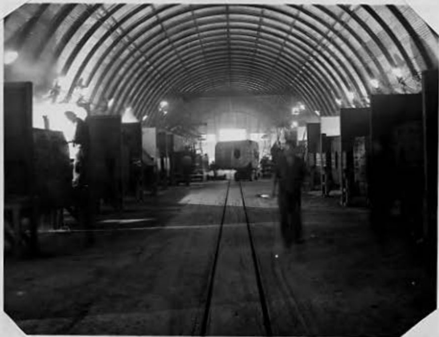
Pontoons are in the process of being welded in the booths on both sides of the factory.