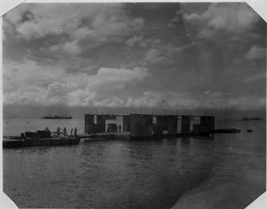
A 200 ton pontoon drydock and tender barge were built by PAD #3. Ships are in the background beneath a lowering tropical sky.