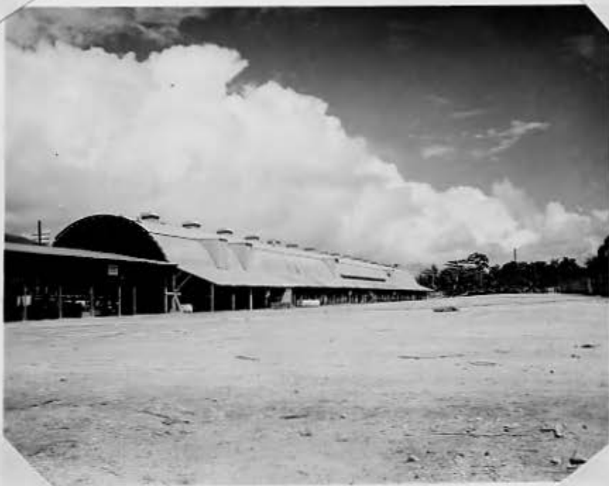
The PAD #3 factory is run with all the skill and efficiency of American industry half-a-world away.