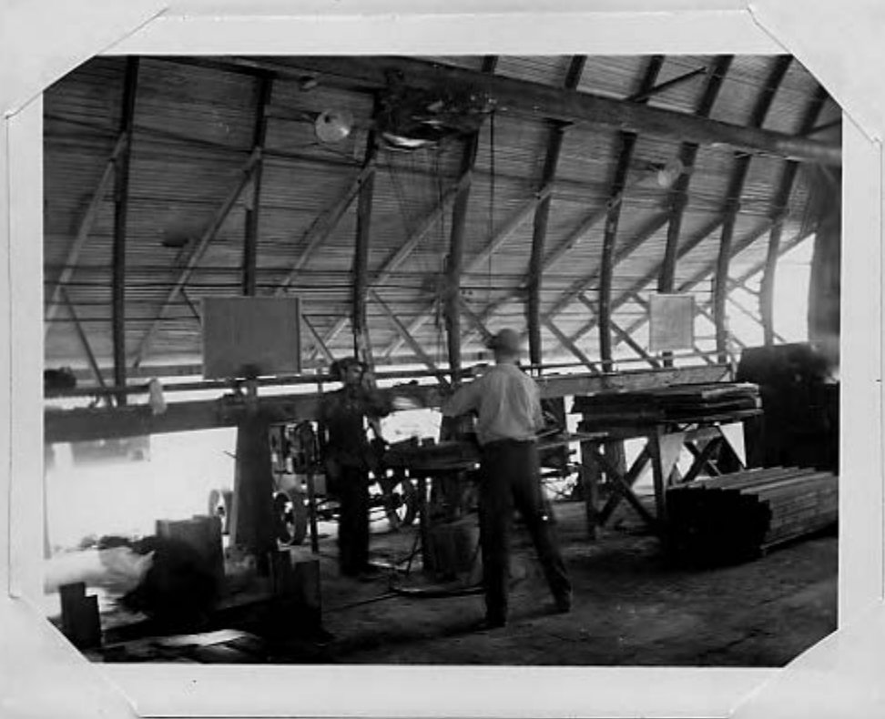
Construction is begun on a pontoon in what is called a "pre-fab jig". The initial welding is done here.