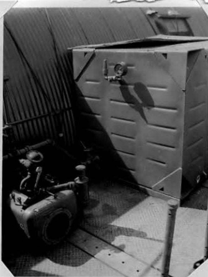
This is a hot water storage tank made out of a pontoon. This tank was placed on board a pontoon barge and was used by the men living on the barge.