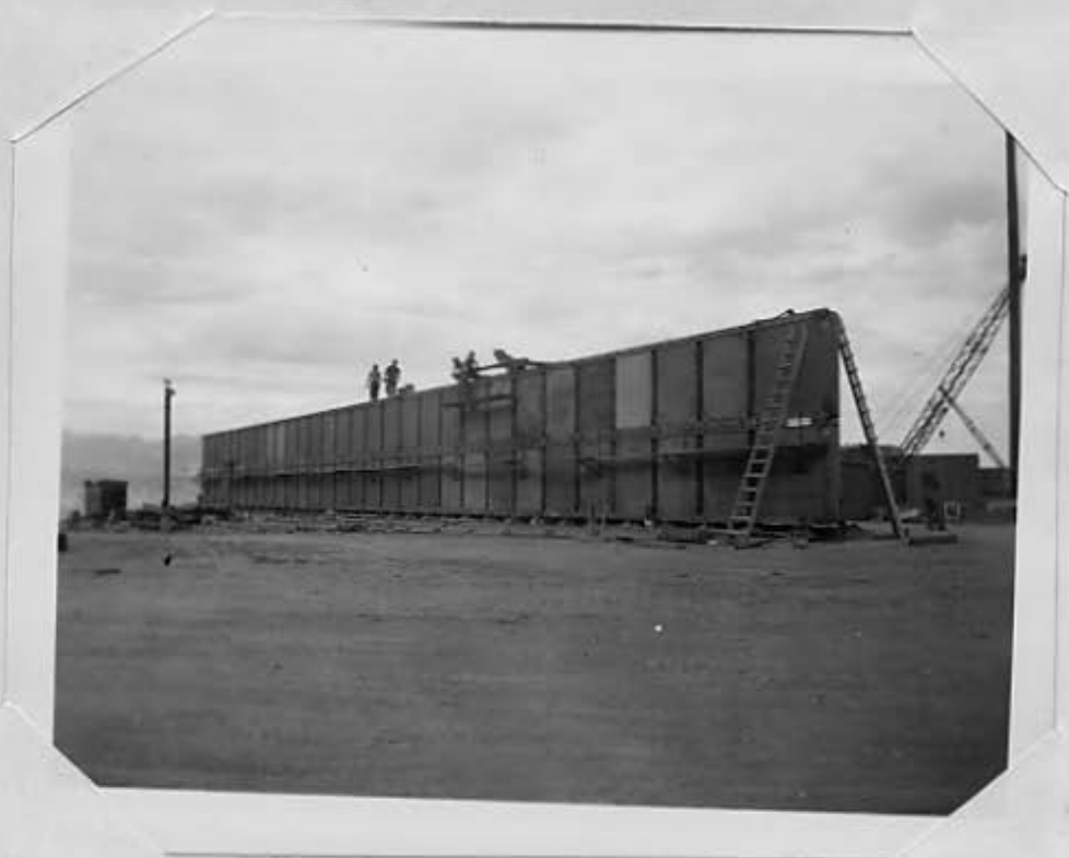
This pontoon causeway is nearing completion. A small amount of work is done after the pontoon has been launched.