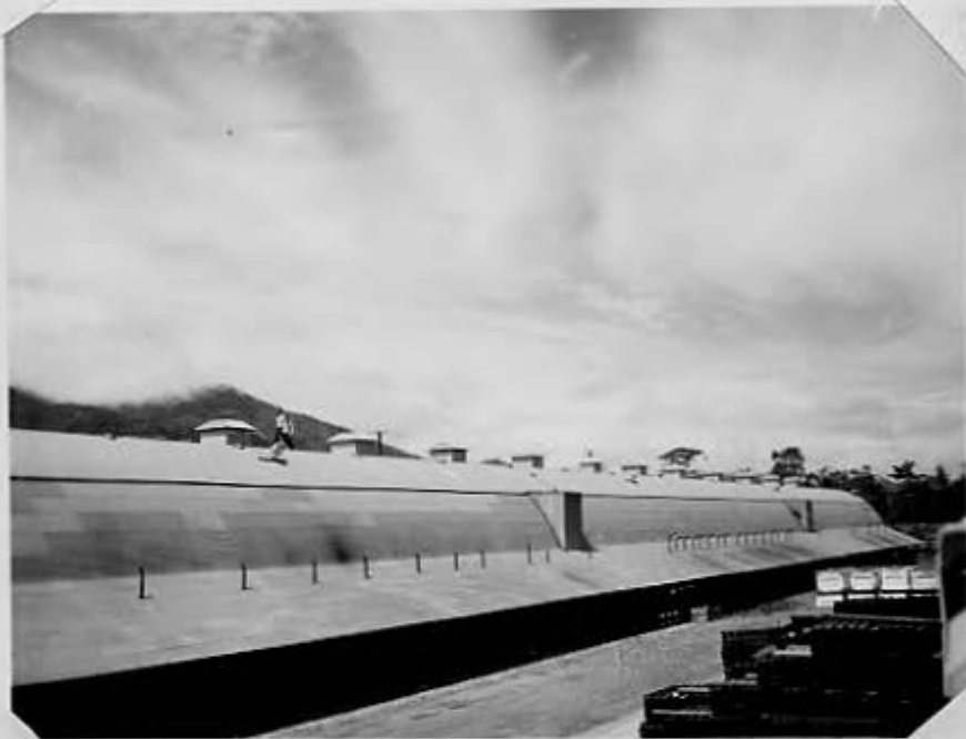
Material for pontoons lies outside the PAD #3 factory. This material is called "kd" pontoons by the men of PAD #3. "kd" stands for "knocked-down."