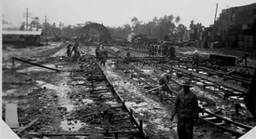
Construction of factory went on under a rainfilled sky and the men waded in mud day after day.