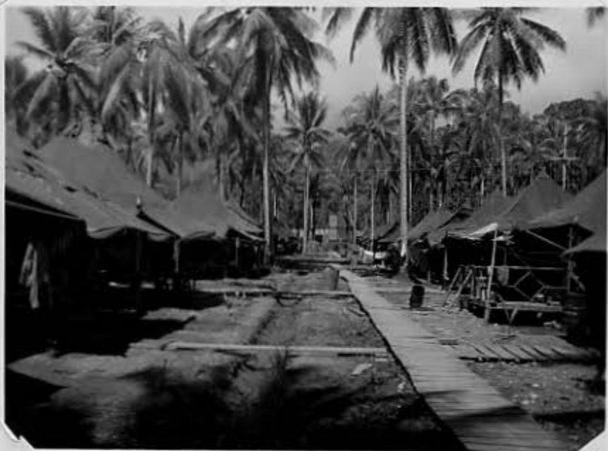
This the South Pacific Home of PAD #3 men. The sides of the tents are open to catch the breeze off the bay.