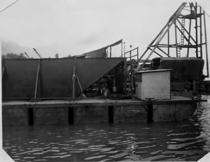
PAD 3 Constructed a special garbage disposal barge.