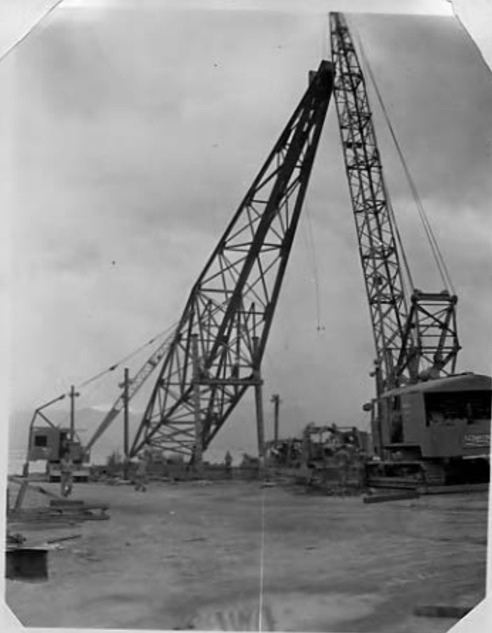
The versatility and skill of the men of PAD #3 are demonstrated in the construction of this 75 ton crane on a pontoon barge. The barge is 6 pontoons wide and 18 pontoons in length.