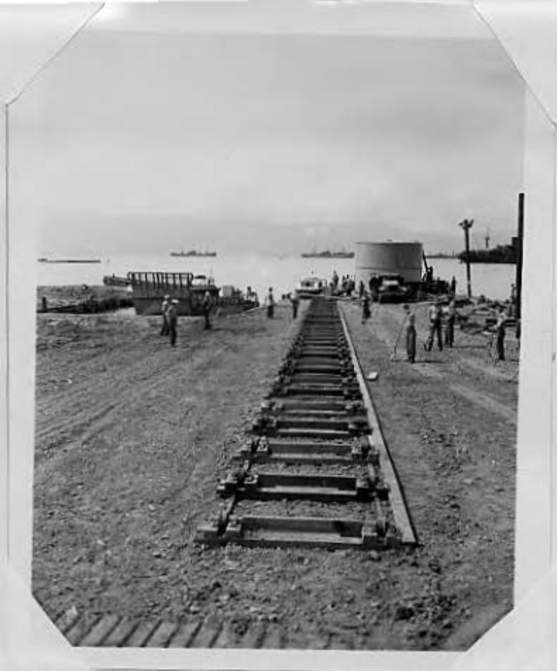
PAD #3 constructed this 185 foot "end launching-ways" on which pontoon structures were built and launched.