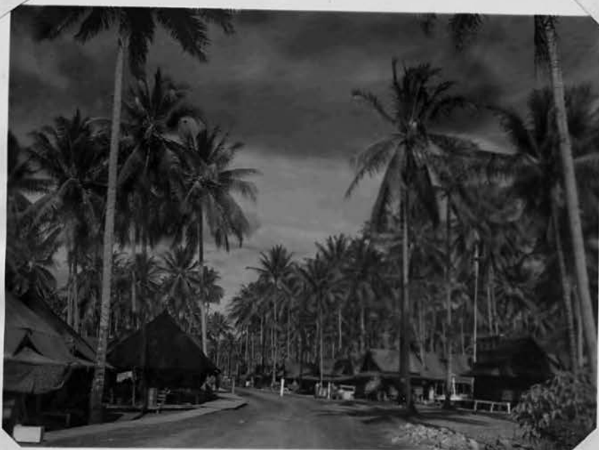
The home of PAD #3 lies in a coconut palm grove. These palms are always rustling in the breeze from the bay while their shadows form moving designs on the ground. Above them, the rain clouds of the monsoon threaten.