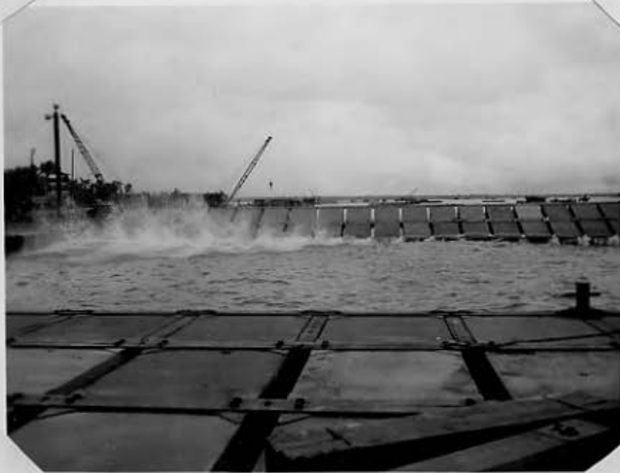
This causeway is being launched by PAD #3. It is made up of pontoons, 2 in width and 30 in length.