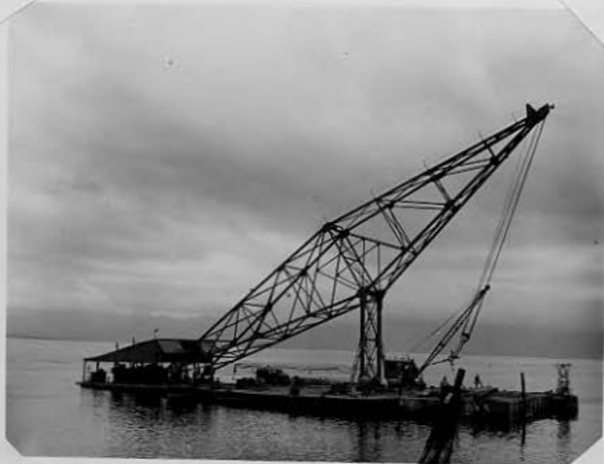
Here the 75 ton crane is seen completed and the pontoon barge is floating off-shore. The tremendous size can be seen when the 75 ton crane is compared with the Northwest Crane along side on the barge. The barge is moved by two propulsion units located on the stern.