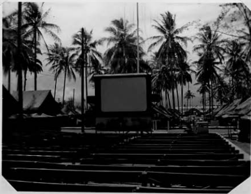
The motion picture theater built by PAD #3 has provided more than 400 pictures for the men of PAD #3. The shows are always attended to a man.