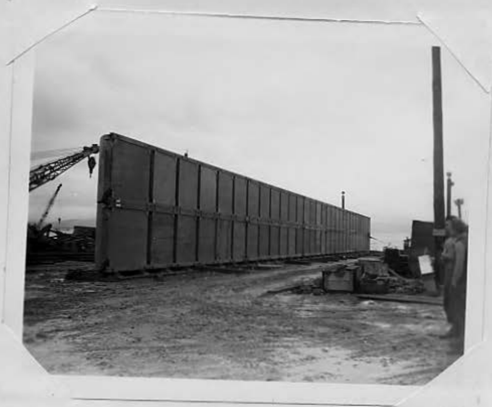
A 2 pontoon by 30 pontoon causeway is on the launching ways ready for the water.