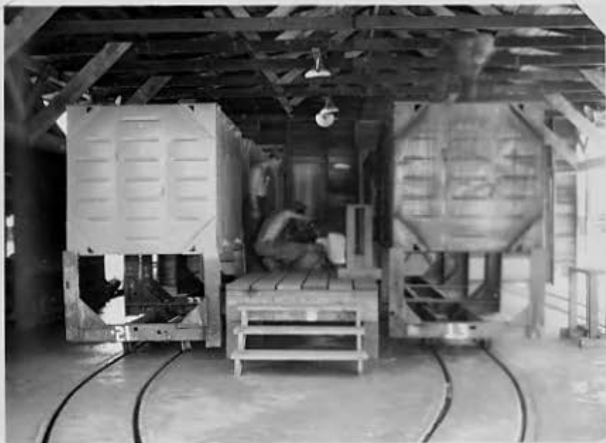
Upon completion, the pontoons are spray-painted. These pontoons are on easily moved carts resting on rails.