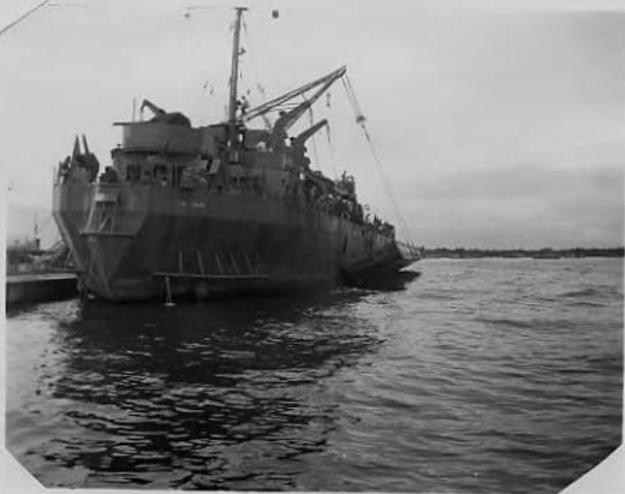
Pontoons are being loaded for an invasion. The pontoons are fastened together, two pontoons in width and thirty in length, forming a causeway. This causeway will be carried on the side of the LST.