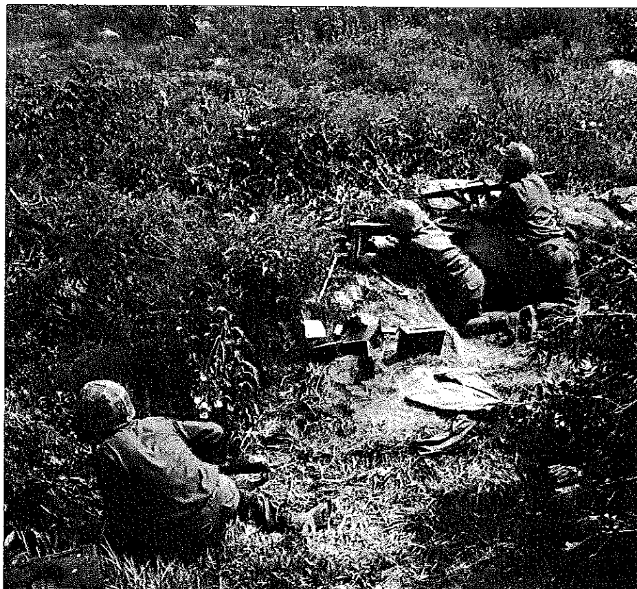
Three Seabees guard part of the perimeter during the Field Exercise at Camp Fogarty.

To complete the homeport military training cycle,