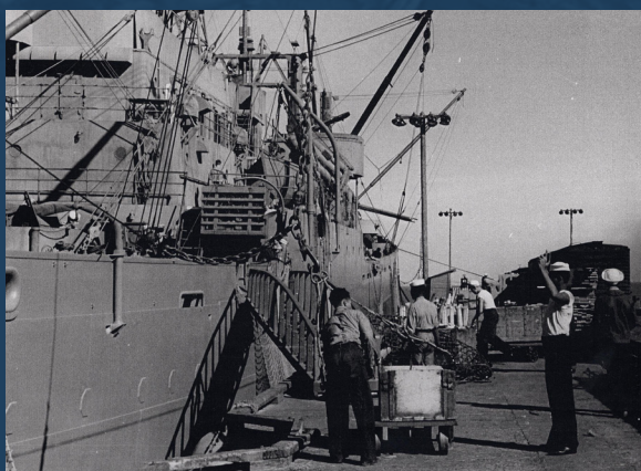
View of loading activity at the Port Chicago Naval Magazine munitions pier, circa 1943/44.