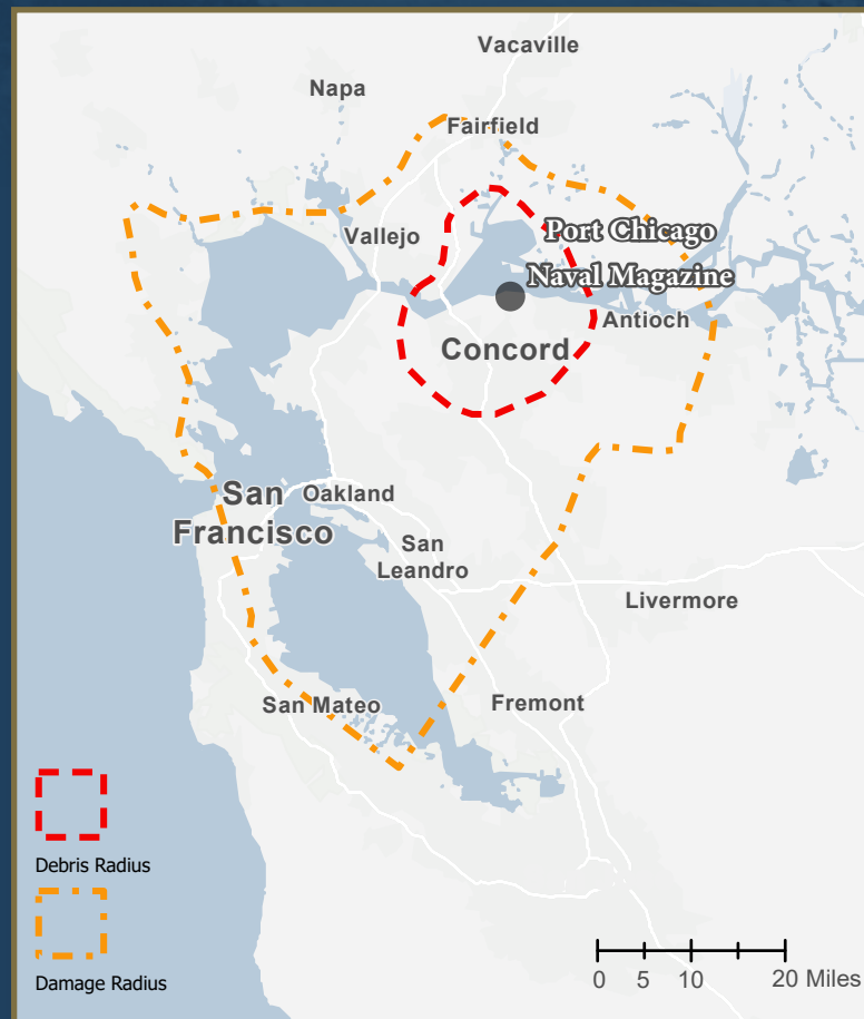
Debris-impact area and blast-effect radius of the Port Chicago Naval Magazine explosion.