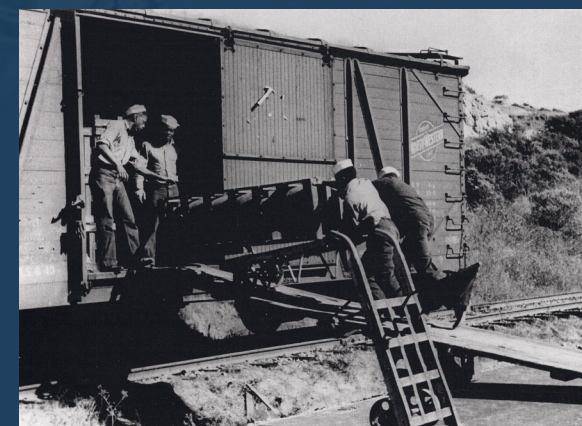
African American sailors from a naval ordnance battalion unload aerial bombs from a railcar, Port Chicago Naval Magazine, circa 1943/44.

Learn more about the Port Chicago magazine explosion at history.navy.mil