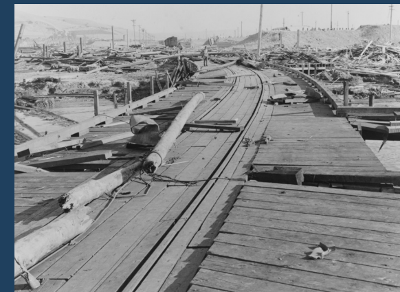
Southward view from the munitions pier showing on-base wreckage (U.S. Navy).