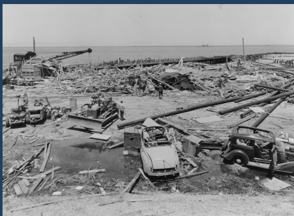
Northward view of the effects of the 17 July 1944 explosion, showing the damage to buildings and munitions pier beyond.