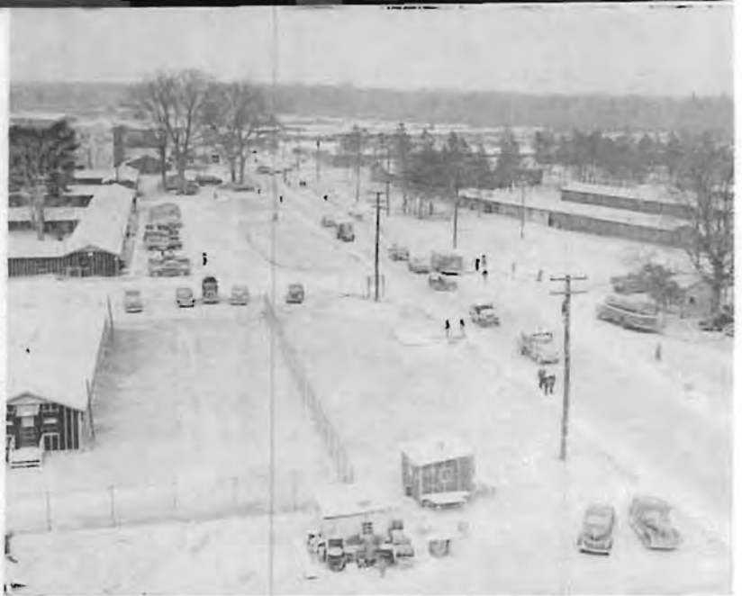
Camp Peary, Va., where was born the 145th Naval Construction Battalion in November 1943.