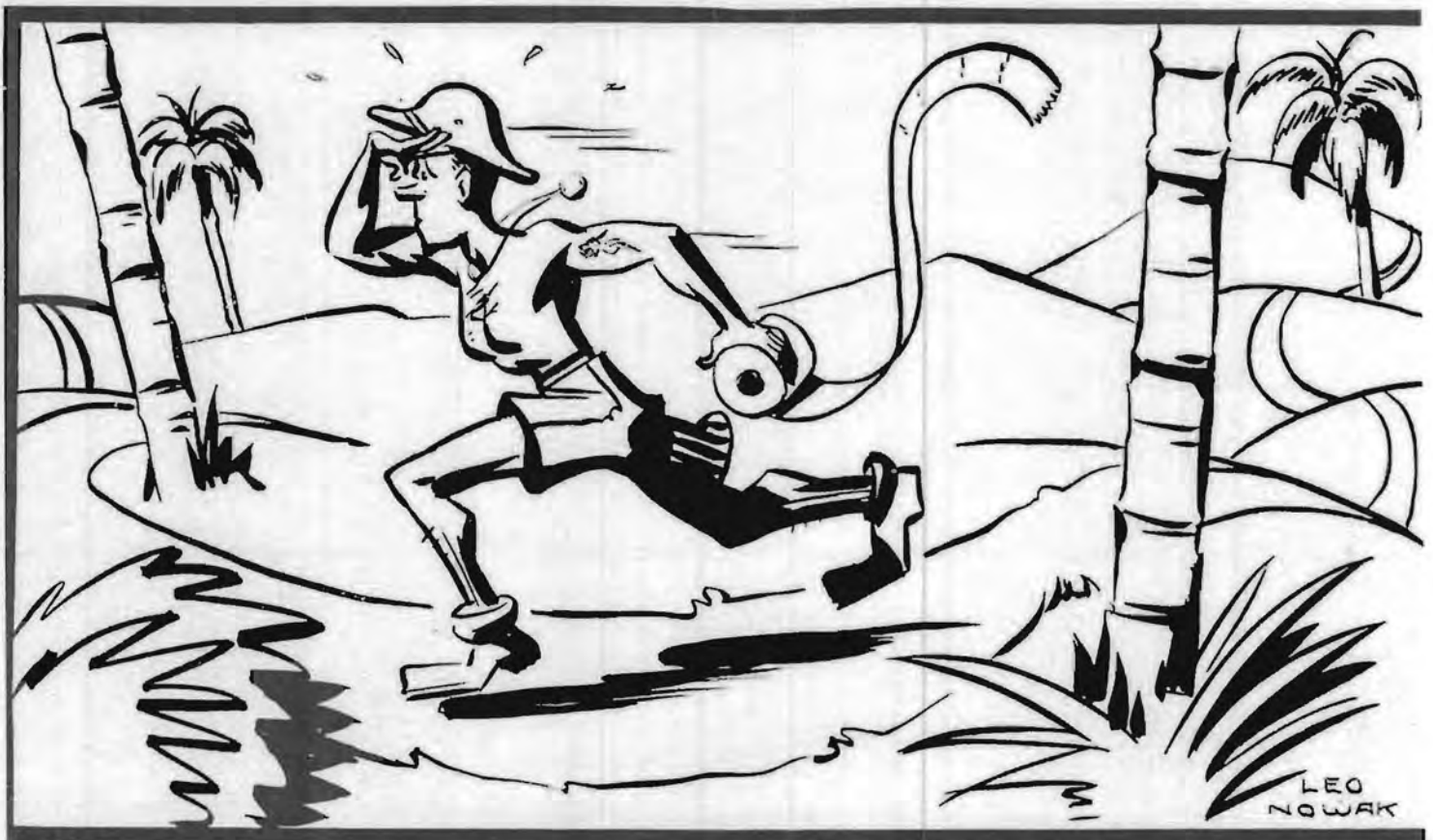
Head Hunting in Solomons

On December 17th the first issue of the battalion's official newspaper