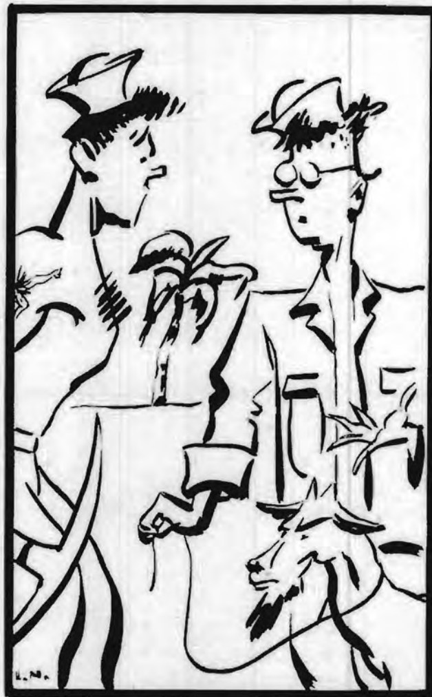
"Mascot Hell! This is today's chow rations."

after our arrival, men whose homes were west of the Mississippi, were given embarkation leaves. After a great deal of working and drilling, and a few San Francisco-Oakland liberties (discouraged by the lengthy hike from the gate to our area) we were ready to move again. This time it was to Camp Rousseau at Port Hueneme, California. And when we boarded trains (day coaches again) for southern California, we knew we were outward bound, for Port Hueneme was a noted "jumping off" place