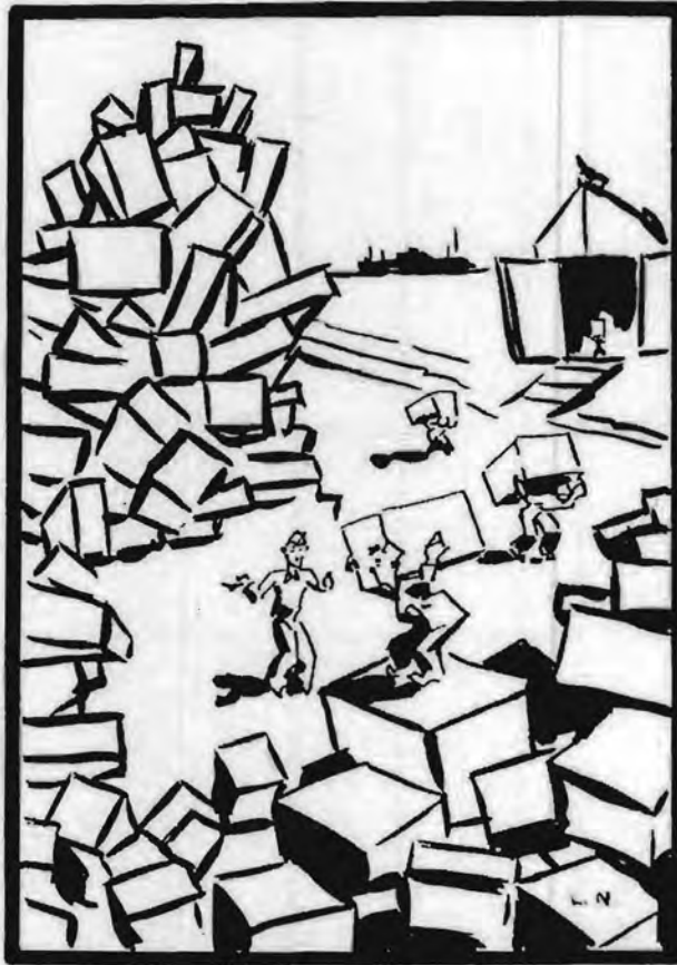
"Load it up again Seabees—wrong island."

ties, new chow halls, a large theatre, a recreation hall, and showers with running water. Park Avenue, the main thoroughfare thru camp, was converted from a one-way rut of mud to a broad, smooth, gleaming street, one of the finest on the island.