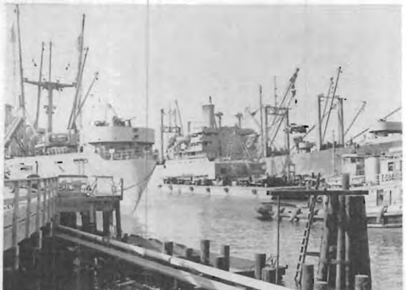
From Camp Endicott the 145th went to Camp Parks, Calif., for further training, thence to Port Hueneme, Calif., for the finishing touches, and then the waiting ships on April 6, 1944.