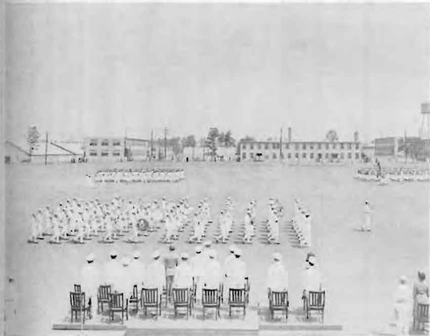
From Peary to Camp Endicott, R. I., where the 145th was whipped into a functioning unit and on the final day of 1943 was commissioned.