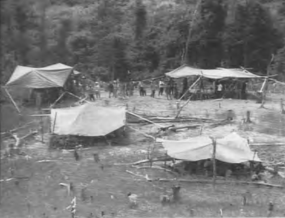
At the C-130A crash site, local villagers form a "bucket brigade" to help move soil being carefully examined during excavations. Under the covering at the left, recovery team members sift through each bucketful to make sure that no remains escape detection.

Det Two, located in Hanoi, has greater scope than the other detachments because most of the missing were lost in Vietnam and its coastal waters. Its staff also works closely with counterparts in the Vietnamese government to help bring about the ex-