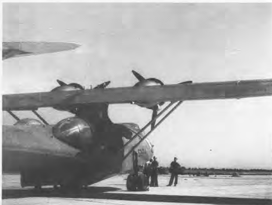
The PBY-5 Catalina could fly 12-hour ASW patrols. Beaching gear allows storage and servicing of flying boats ashore.

AirLant was formed in Norfolk in January 1943 under the flag of Rear Admiral Alva D. Bernhard. The new command was to take the place of three older organizations: Commander