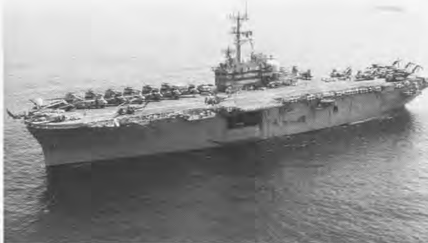
Tripoli (LPH 10) off the coast of Mogadishu, Somalia.