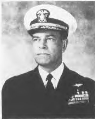
VAdm. Patrick N. L. Bellinger, ComAirLant, 1943-46.

ral in October 1943. He was ComNavAirLant until 1946. The position has remained a three-star billet ever since.