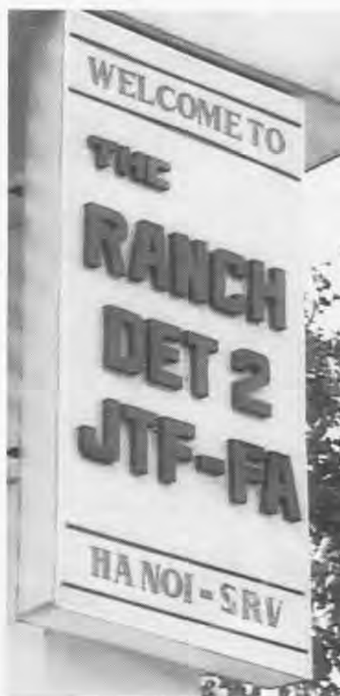
JTF-FA headquarters for operations in the Socialist Republic of Vietnam is a cluster of small buildings in a Hanoi suburb.

But the life support system fragments generated the most interest, since they would be closest to human remains. For the video camera, West described a number of objects: pieces of flight gloves, chunks of oxygen hoses and parts of parachute risers.