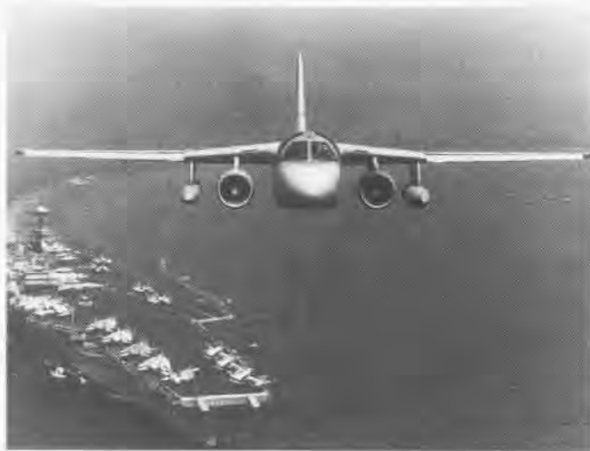
An S-3B overflight of Saratoga (CV 60).