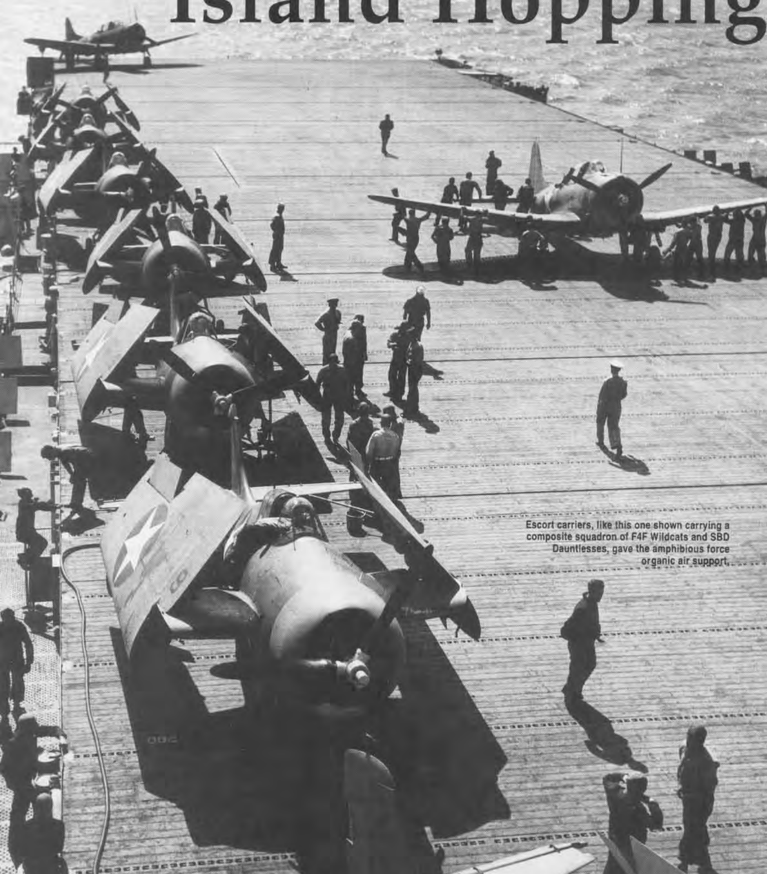
Escort carriers, like this one shown carrying a composite squadron of F4F Wildcats and SBD Dauntlesses, gave the amphibious force organic air support.