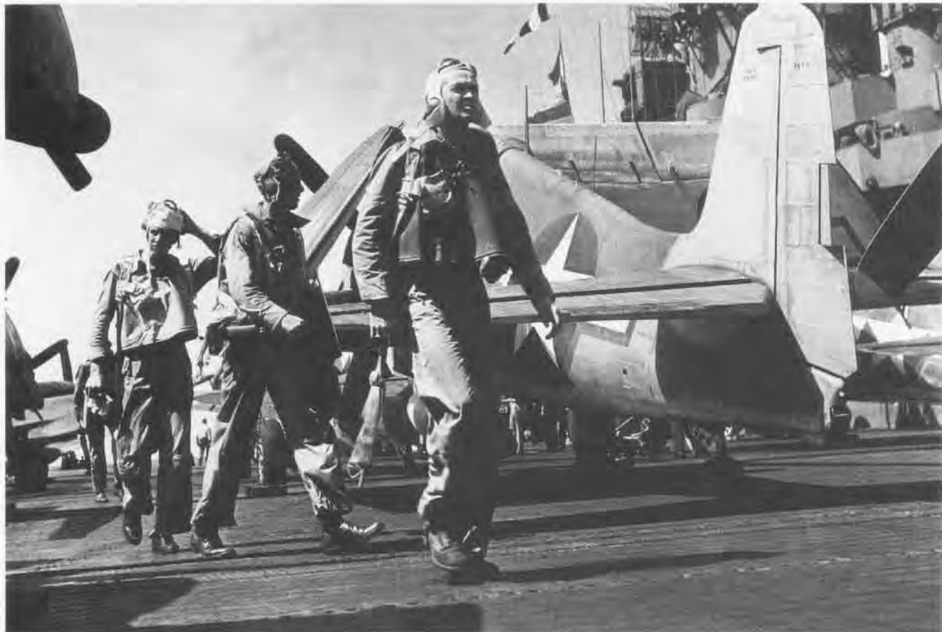
Lexington (CV 16) Hellcat pilots return from a strike during the Gilberts operation, November 1943.

lap busy as the escort carriers and gunnery ships of the amphibious force joined in.