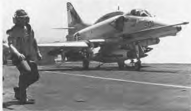
An A-4E prepares to launch from Oriskany (CVA 34).

Those who have stood in the arena, and that includes many in this audience, fully comprehend the significance of that statement. I'm most fortunate in that I have the example of leaders, both senior and junior to me, who have set such fine examples in handling adversity in their own lives.