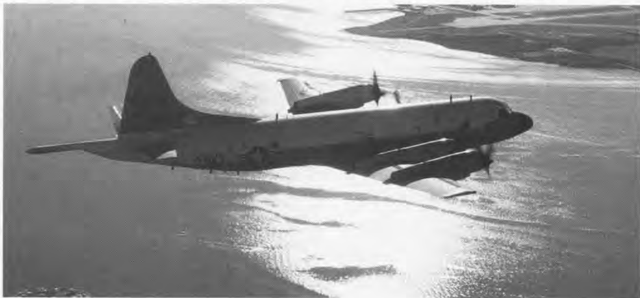
A VP-62 P-3C returns from a mission to NAS Jacksonville, Fl.