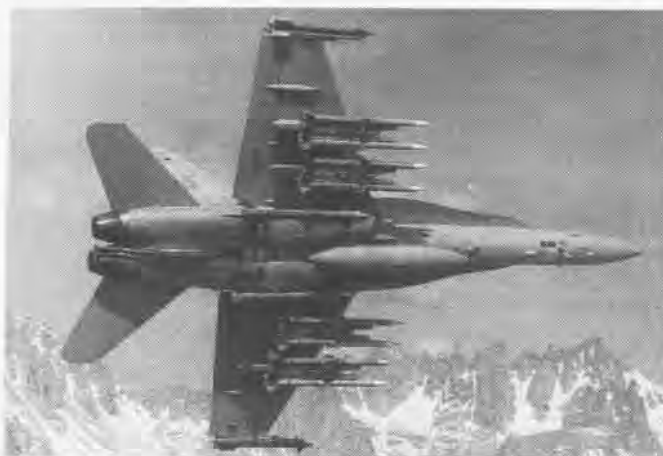
An FA-18C Hornet from VX-4 on a test mission with 8 AMRAAMS and 2 Sidewinder missiles.

The Navy approved the AIM-120 Advanced Medium Range Air-to-Air Missile (AMRAAM) for use on fleet FA-18s. In September 1993, Hornet squadrons fired 30 AMRAAMs during exercises on both coasts; 28 missiles performed properly. The AMRAAM is a lighter, faster missile than the AIM-7 Sparrow and has a multi-shot launch and leave capability. The AMRAAM was developed in the early 1980s as a joint serv-