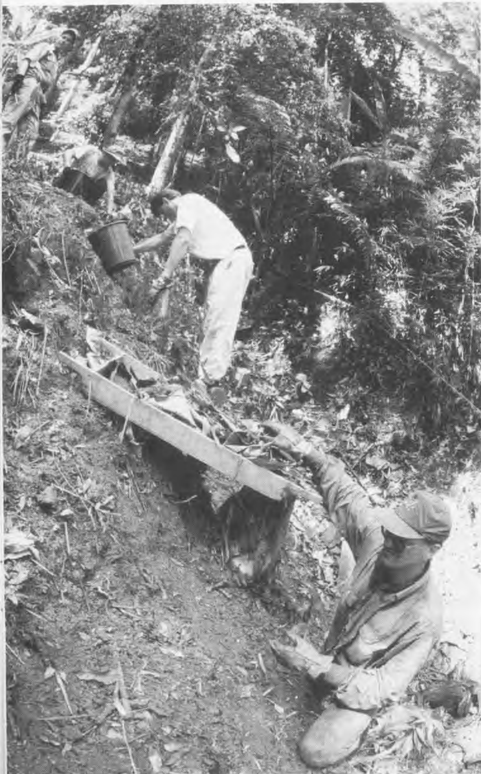
JTF-FA searchers explore a steep hillside in Savannakhet Province, Laos People's Democratic Republic.

Sorting out the details of incidents that happened over 20 years ago is