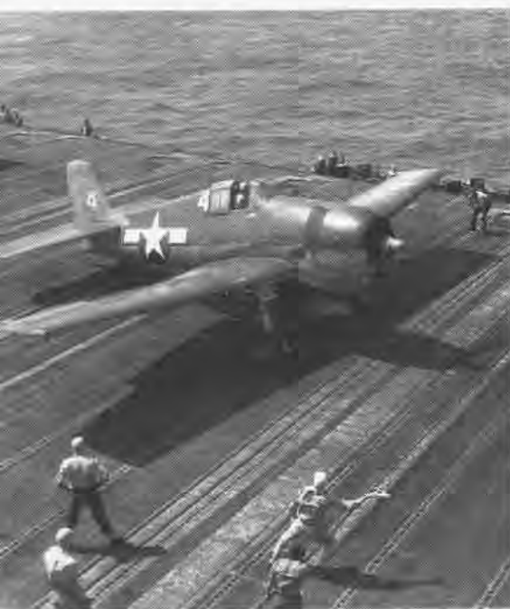
By the opening of the central Pacific offensive, the Grumman F6F Hellcat had replaced the F4F Wildcat in the Fast Carrier Force.

The assault on the Marshalls was being planned well before the Gilberts landings. The first plan prescribed landings on the Kwajalein, Wotje and Maloelap atolls. After Tarawa, Navy and Marine Corps commanders con-