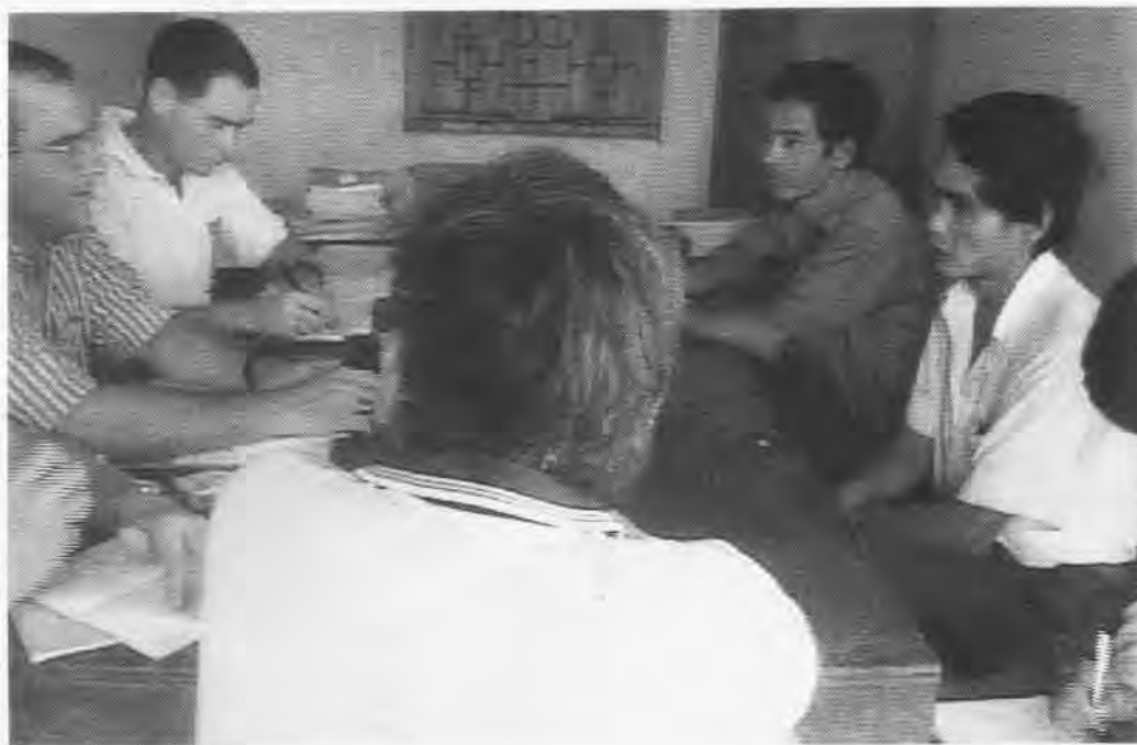
Members of the investigative team meet with Vietnamese government MIA representatives and local officials prior to beginning research operations in the countryside not far from Da Nang.