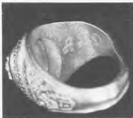
A fiancée's high school class ring inscribed with the initials "ALD" was discovered at the crash site in Laos. The ring helped investigators determine the fate of one unaccounted for.