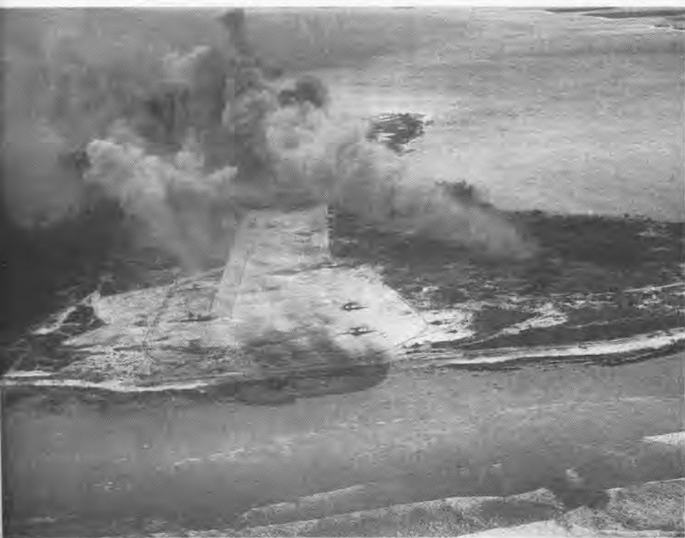
Planes from Langley (CVL 27) rake an Eniwetok airfield during the invasion of the Marshalls, February 1944.

cluded that their resources still did not permit three simultaneous invasions and recommended that Maloelap and Wotje first be taken and turned into bases to support an attack on Kwajalein. Adm. Nimitz caused a stir among his commanders when he opted to bypass the other atolls and take Kwajalein alone, reasoning – correctly, as it proved – that the outer atolls would be more strongly defended. Adm. Spruance got authorization to occupy Majuro Atoll in the eastern Marshalls for an advanced air and fleet base.