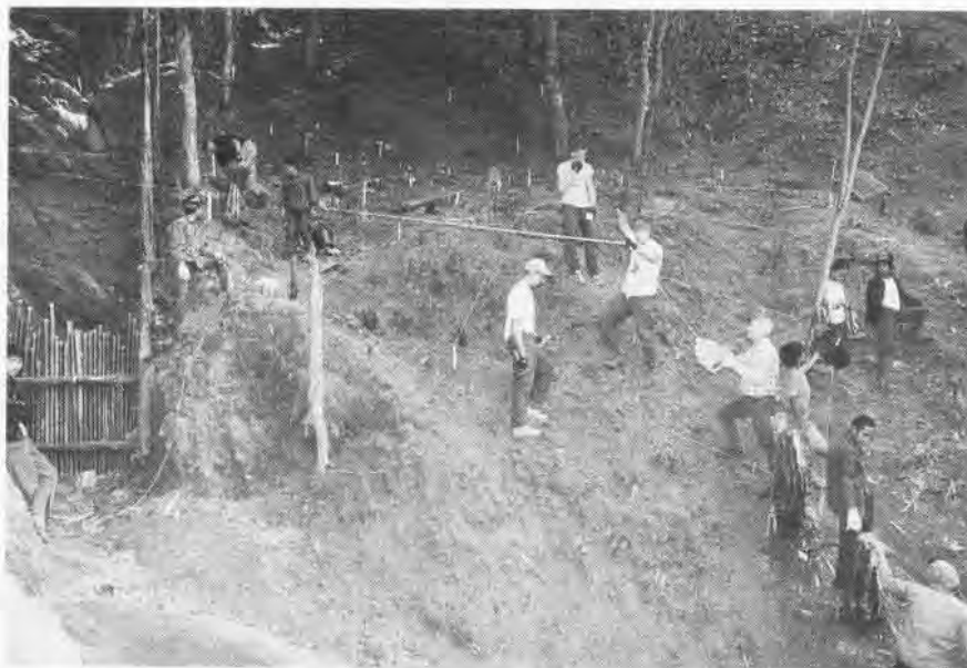
Workers establish a grid system to ensure every inch of the crash site is thoroughly canvassed for remains.