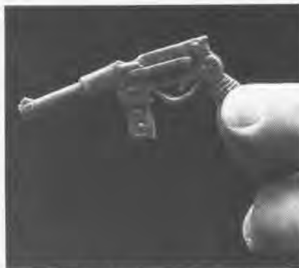
A departing gift from a child to an aviator father? Perhaps, but we may never know. Although uncovered at a crash site, the passage of time has prevented an answer.