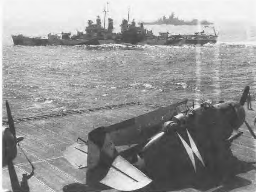
Carriers and "gunships" of Task Force 58 teamed up with the amphibious force to give the Pacific Fleet a powerful one-two punch.

"Island Hopping in WW II – The Marianas" will appear in NANews , Mar-Apr 93.