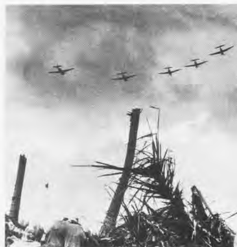
Riflemen of the 4th Marine Division advance on Roi-Namur with the help of carrier planes.

The capture of Kwajalein went so well that Adm. Spruance did not have to commit his reserve troops and was ready to proceed without delay to cap-