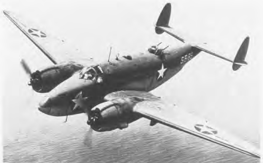
Lockheed PV-1 Venturas were among the land-based patrol planes used in ASW operations.