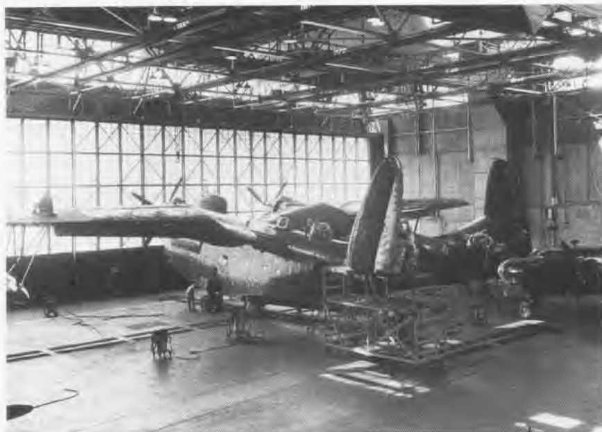
Hampton Roads Naval Museum