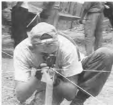
Above, using standard surveying techniques, a member of the recovery team verifies proper placement of grid lines for excavation operations at the C-130A crash site in A Luoi, Vietnam. Below, near the C-130A crash site, villagers are using a wing flap to dry rice.

The team then documented the JTF-FA's four detachments in Southeast Asia, each headed by an Army or Air Force lieutenant colonel. At the U.S. Embassy in Bangkok, Thailand, they covered Det One, which provides the administrative and logistics support for operations in the region.