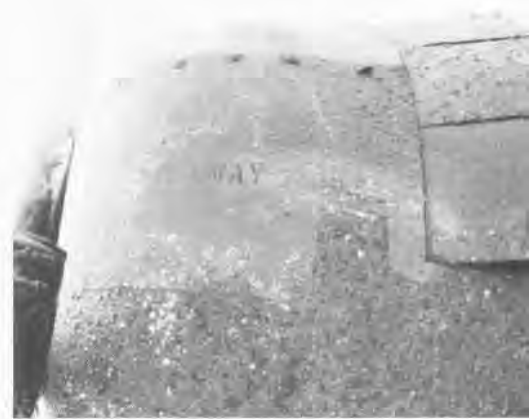
The marine growth has been brushed away to reveal an inscription of the plane's heritage.