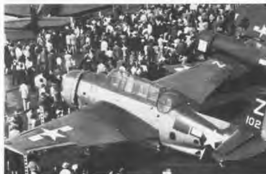
Navy wartime aircraft attracted public attention when put on display around the country.

1Ws, under Project CADILLAC, was a major step on the way to today's AWACS (Airborne Warning And Control System). Exploration of space rockets and development of rocket motors, one of which would later power the Air Force's Bell X-1 through the sound barrier, and joint development of the initially jet engine-powered Douglas D-558 series of high-speed research aircraft with the National Advisory Committee for