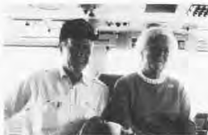
Former president George Bush and his wife Barbara visited George Washington (CVN 73) while in Norfolk, Va., to mark the 50th anniversary of V-J Day. Bush is a decorated WW II Naval Aviator.

Theodore Roosevelt (CVN 71)-based F/A-18 Hornets , F-14 Tomcats , EA-6B Prowlers and E-2C Hawkeyes , in conjunction with other NATO aircraft, carried out air strikes against Bosnian Serb military targets in Bosnia in late August and early September. The NATO air strikes targeted surface-to-air missile sites, radar sites, communications facilities, ammunition depots and local command posts. The strikes came as a direct response to a Bosnian Serb artillery attack on a Sarajevo market.