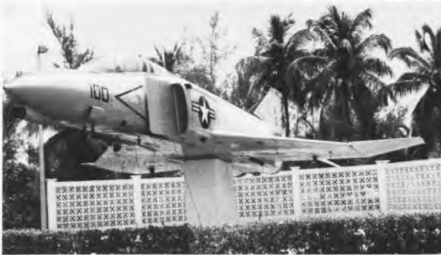
VF-101 established a permanent detachment in Key West in 1989. This F-4 Phantom static display pays tribute to the squadron's storied past.

Key West often plays host to both the F-14 Tomcat and F/A-18 Hornet communities. These squadrons send detachments, including aircrew, maintainers and aircraft, to the air station on a regular basis. These dets not only give the pilots and radar intercept officers the opportunity to fly against VF-45 and use the TACTS range, but they also tend to break up the monotony of day-to-day life wherever the