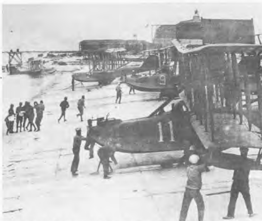
Naval Air Base, Key West was officially established in 1917. By 1918, the fledgling facility had become a major seaplane training center.

Key West is an island at the end of a chain running from the southern tip of Florida. With an average temperature of 77 degrees, it is a year-round tourist attraction. It is also a romantic getaway famous for its sunsets, and its nightlife is one of the most dynamic in the free world. But, what does it offer the military? How does the most unlimited airspace along the eastern seaboard and one of the most active search and rescue units in the world sound to you? That's impressive, but what else? How about the challenge