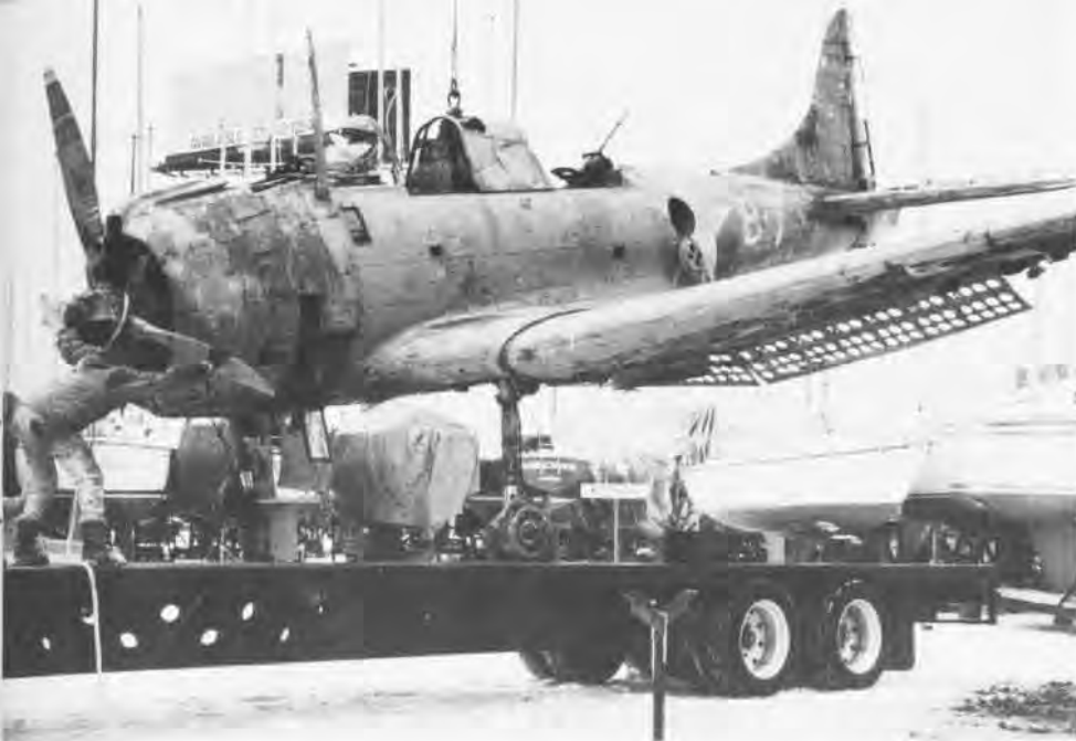
Opposite page, top, the veteran of the Battle of Midway sees the light of day for the first time in 50 years. Above, the remarkably intact Dauntless is carefully lowered onto a flatbed for transport to Florida.