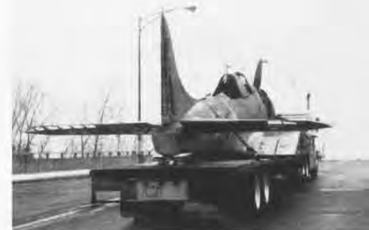
The Dauntless begins its long journey toward restoration.

For a copy of the brochure "Sunken Naval Vessels & Naval Aircraft Wreck Sites," which outlines the Navy's policy regarding custody and management of wrecks, or for more information about the program, contact: Underwater Archaeologist, Naval Historical Center, Building 57 Washington Navy Yard, 901 M Street SE, Washington, DC 20374-5060; phone (202) 433-7229/7230, fax (202) 433-3593. ■