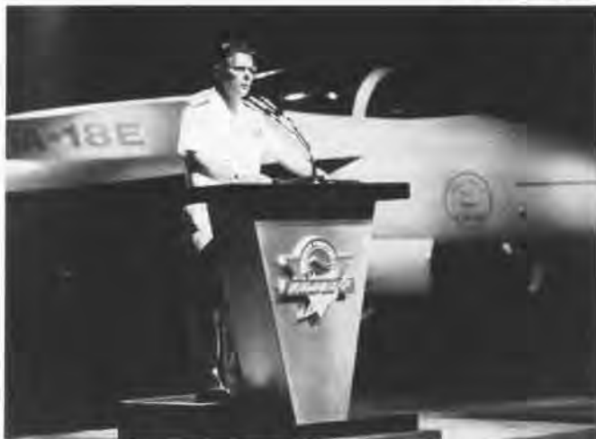
Chief of Naval Operations Adm. Mike Boorda announces the name of the new F/A-18E/F: "Super Hornet."