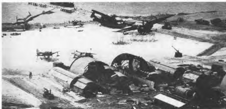
The Navy seaplane base at Okinawa was devastated by a typhoon on 9 October 1945. The storm's 135-knot winds tossed aircraft about and destroyed several buildings.

jet fighter, Douglas XBT2D-1 (later AD and A-1), XBTM-1 (AM) and XP2V (later P-2)—were given higher priority. While production of the composite (piston and jet)-engined FR-1 Fireball was terminated, development of the XF2R-1 (similar but with its R-1820 Cyclone replaced by a GE TG-100 turboprop) was continued in support of planned production development of a similar F2R-2 turboprop plus jet fighter. While a flight test accident destroyed the first of the three XFD-1s in November, the second was already flying and the program continued with only limited delay.