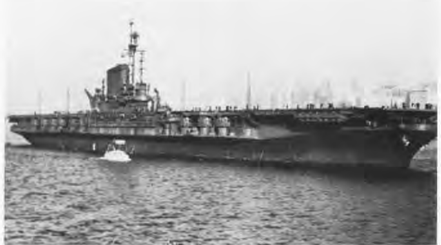
Midway (CVB 41) was commissioned in September 1945.

Carefully selecting the models, the Bureau of Aeronautics (BUAER) continued limited production of ongoing and newly developed models.