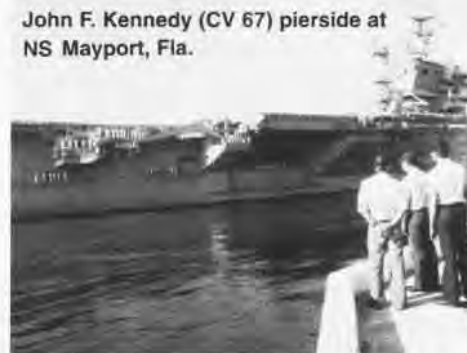
John F. Kennedy (CV 67) pierside at NS Mayport, Fla.

John F. Kennedy (CV 67) left the Philadelphia Naval Shipyard 13 September for her new home port at Naval Station, Mayport, Fla., after completing a two-year, $491-million comprehensive overhaul. The 27-year-old aircraft carrier has been designated an operational reserve carrier and Naval Reserve Force ship and will embark Carrier Air Wing Reserve 20 during at-sea flight operations.