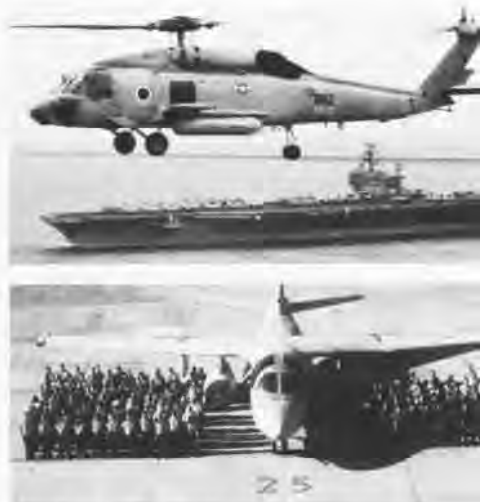
Top: An HS-3 HH-60G Seahawk flies alongside Theodore Roosevelt (CVN 71). Above: Members of VS-31 posed for this photo to celebrate 25 years of mishap-free flying.

The following members of VFA-22 earned their "Double Centurion" patch