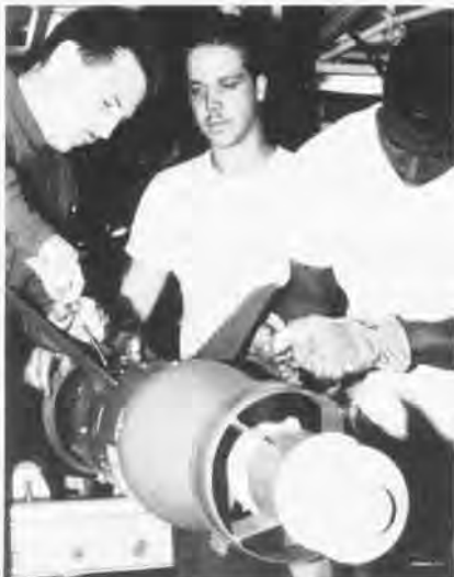
Theodore Roosevelt (CVN 71) aviation ordnancemen make preparations for NATO air strikes in Bosnia in late August 1995.