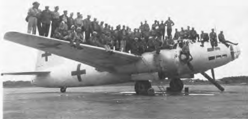
Navy personnel pose on top of an all-white Mitsubishi G4M "Betty" with the green cross markings that it carried when transporting the Japanese delegation to the surrender signing. 80-G-344085