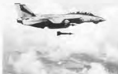
An F-14 Tomcat delivers a 500-pound, laser-guided bomb.

Integrated Defensive Electronic Countermeasures (IDECM). In the late 1960s and early 1970s the appearance of radar and infrared surface-to-air missiles necessitated the