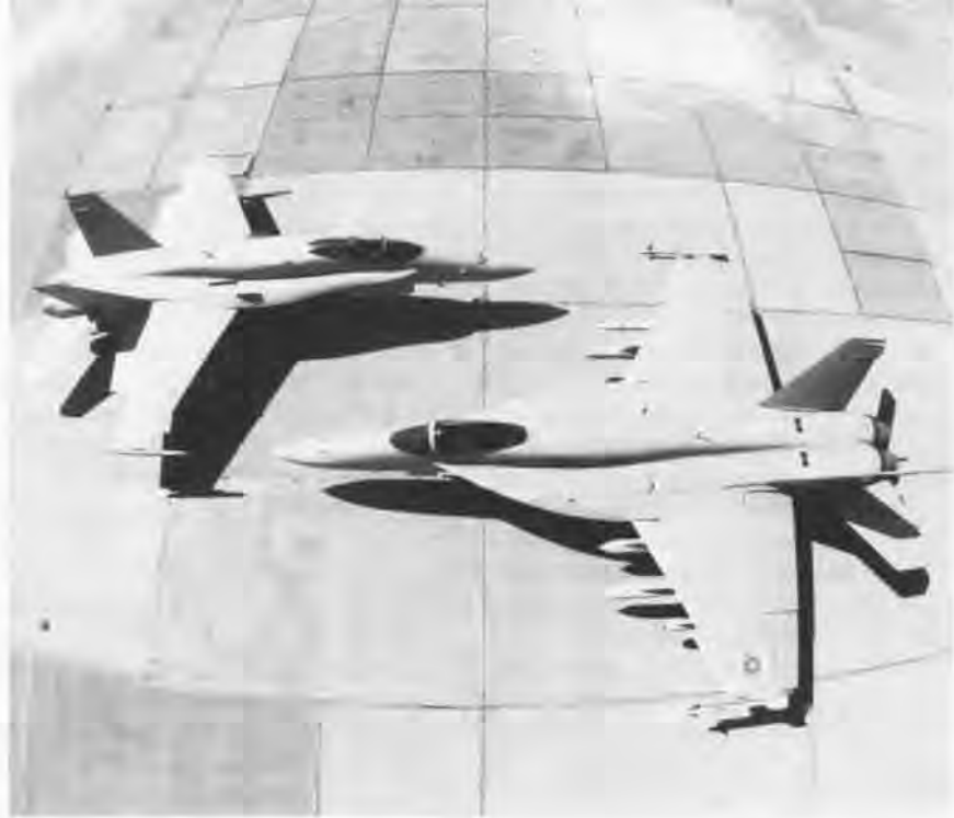
A side-by-side comparison of the F/A-18E (foreground) and the F/A-18C Hornet.

FLIR/laser designator using the proven LANTIRN pod, developed by Lockheed-Martin for the Air Force, was chosen. The proof of the design came through a rapid prototype flight demonstration program sponsored by Commander Naval Air Force, U.S. Atlantic Fleet when a modified fleet Tomcat successfully dropped and guided four out of four laser-guided bombs.