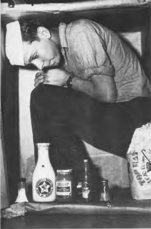
Veterans were anxious to get home. One sailor's fanciful suggestion was to use a cardboard box stocked with food for the trip.

forces deployed in China as the rising conflict between Nationalist and Communist factions flared into civil war. Seventh Fleet escort carrier-based aircraft, as well as river-based patrol flying boats where airfields were not available, also covered activities in China. While the U.S. supported the Nationalist side, military forces were restrained from directly participating in a combat role.