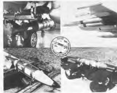
Various competitors' entries for the Joint Direct Attack Munition.

Three contracting teams are currently refining their design concepts for a competition in spring 1996. Ultimately, two contractor teams will build their proposed designs and demonstrate their ability to build a family of aircraft to meet the needs of all three services. Current designs show the potential for a Navy variant to carry two precision guided munitions and two air-to-air missiles internally for an interdiction mission in excess of 600nm without drop tanks or in-flight refueling. The up-and-away performance will be equivalent to or better than the current F/A-18C. The benefits of a very stealthy aircraft on our carrier flight decks will add an