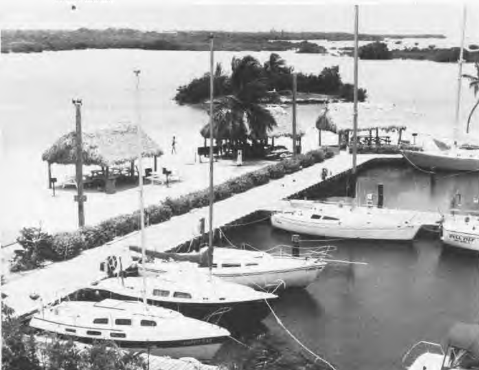
The marina aboard Boca Chica provides boat slips and picnic areas for base residents to use year-round.