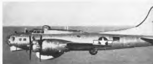
Boeing B-17Gs were obtained from the Army Air Corps and modified at the Naval Air Modification Unit, Johnsville, Pa. (now NAWCAD Warminster), with a belly radome for the powerful APS-20 radar and an Airborne Combat Information Center.

The radio-radar compartment of the PB-1W, a modified B-17G, contains the AN/APS-20 radar, radios and other communications equipment.