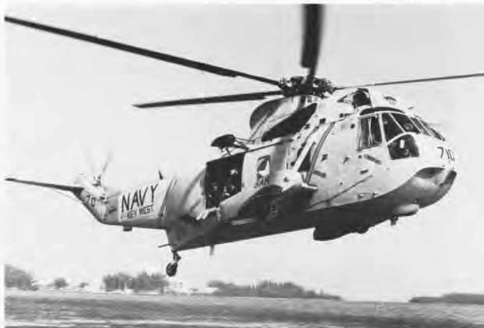
NAS Key West SAR is one of the most active in the world, recording 96 lives saved in 1994 alone. The unit flies the UH-3H Sea King, which continues to be a proven all-weather, day-night search and rescue platform.

The naval air station is actually located on Boca Chica Key, approxi-