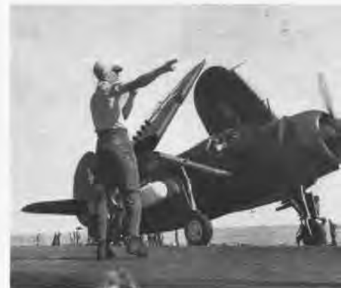
Under the guidance of plane directors, pilots aboard Midway (CVB 41) move their planes forward to make room for others.

Experimental aircraft programs were reviewed and most were continued to completion. Flight testing of prototypes, at low priority, was continued to assess the potential contribution of their design features to future designs. Prototype development and production build-up for planned replacement models already in flight testing—such as the McDonnell XFD-1