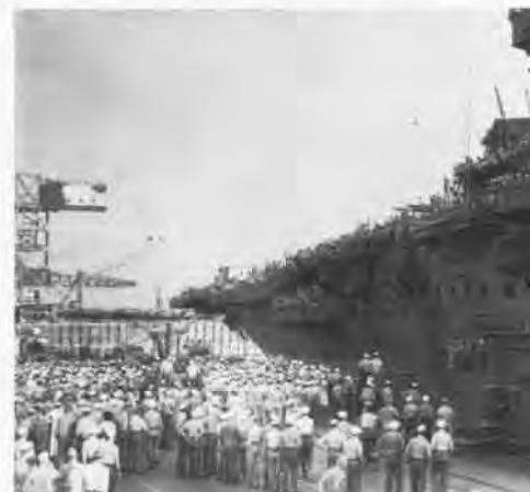
Saratoga (CV 3) waits at Pearl Harbor, Hawaii, on 10 September 1945, ready to begin a speed run to the Golden Gate with naval personnel due for discharge. Many aircraft and escort carriers were used to ferry discharges during the famed "Magic Carpet Ride."

More unsettling to Naval Aviation personnel directly was the upsurge in proposals for unification of the military services—seen as a new bid for the Army Air Forces to become independent and take over military aviation. In mid-December an interpretation of remarks by President Harry Truman led to a directive that Navy officers could not speak out on the subject in public. The president himself stepped