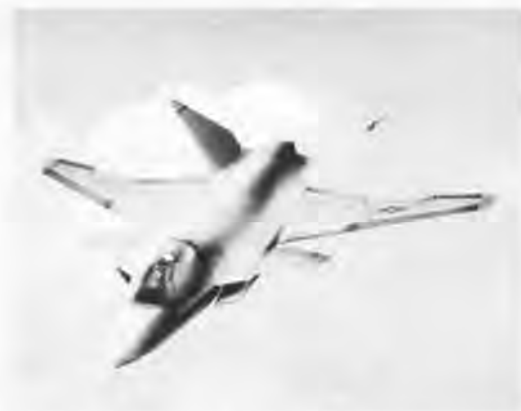
An artist's rendition of the McDonnell Douglas Joint Advanced Strike Technology aircraft.

AN/ARC-210(V) Electronic Protection (EP) Radio. The AN/ARC-210(V) EP Radio, a Navy-led, tri-service program, is planned to replace the AN/ARC-182(V) radio. It is capable of combined UHF/VHF, AM/FM, anti-jam communication for secure voice and data transmission. The AN/ARC-210(V) is the first U.S. Navy radio which provides full battlefield interoperability by using the Air Force HAVEQUICK I and IIA wave-